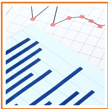
Convert your comet data into attractive graphs and charts