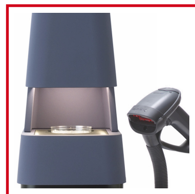
Barcodes allow the system to identify every plate automatically